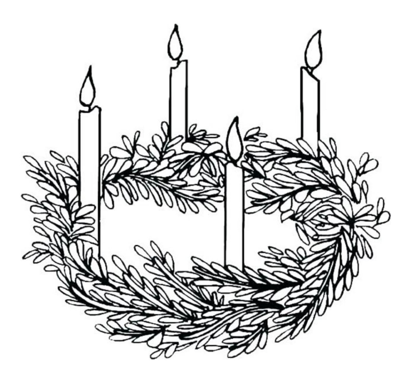
THE FIRST PRESBYTERIAN CHURCH OF ENID THE FOURTH SUNDAY OF ADVENT DECEMBER 24, 2023 | 10:50am